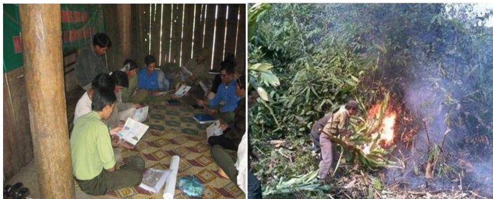
Figure 1. Forest management course and fire fighting in the dry season