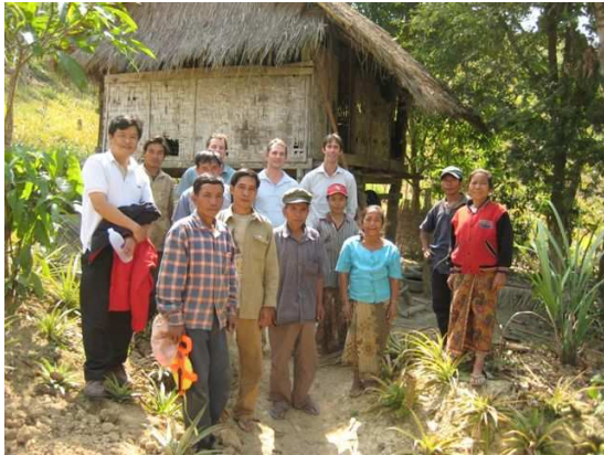
Figure 9. TFT-Forestry Staff-TNC-USAID with local farmers