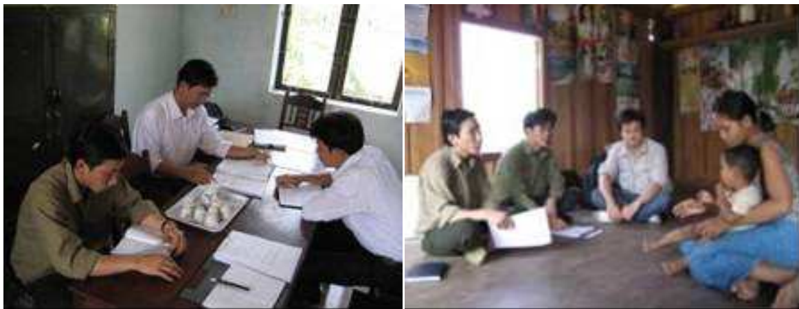
Figure 4. Social impact assessment report writing and interviews with local population

From 20 th February to 2 nd March 2009, while scoping for technical support for the Truong Son State Forest Enterprise (SFE) LDFIC, Quang Binh province and Tropical Forest Trust co-operatively organized the social survey within the State Forest Enterprise. The survey assessed the forestry practices and social status using the SFE's area supporting database and consulting responsible organizations. The aims are to resolve any discontent with the FMU's activities between communities nearby or within the SFE's area, keeping with objectives towards sustainable and responsible forest management and compliance with FSC certification.