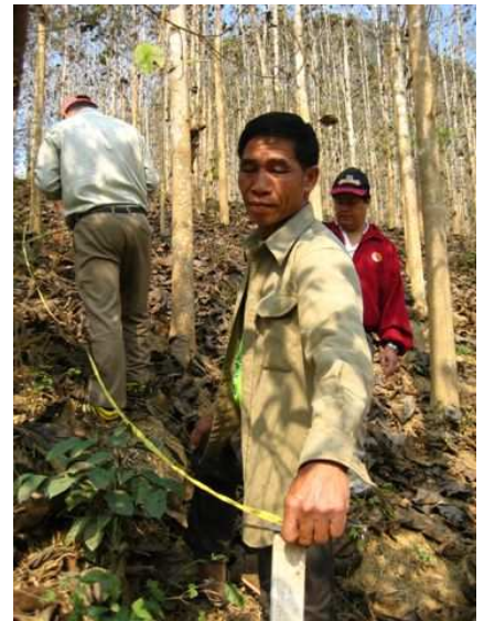
Figure 5.. PAFO.-TFT and Head of Village group undertake a survey of the first teak lot to be registered

As part of the teak lot registration process, surveys have been completed for many teak lots within the Pilot Area. TFT, Local PAFO staff and farmers have already conducted surveys on 30 lots which will soon be registered according to the legal requirements of the Government of Laos. Registration of teak lots is an important step towards sale of teak logs, and it also improves farmers’ awareness of their legal rights. This in turn empowers local people, reducing the likelihood of manipulation by log traders who have, in the past, used the complexity and cost of plantation registration and associated legal requirements as a means to reduce the value of teak logs and therefore the return to the farmer.