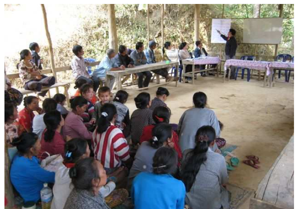
Figure 8. Local Villagers and Farmers attend the Training Day

A successful village training sessions was held in February to help translate international and local expertise on Sustainable Forest Management into a common understanding of the program goals and key requirements towards achieving FSC. The first training was a real success with in excess of 105 villagers in attendance. This leaves the program implementers in no doubt of the interest and commitment of villagers in the program.